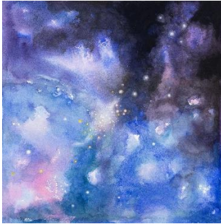
Holley Flagg , Star Forming Region