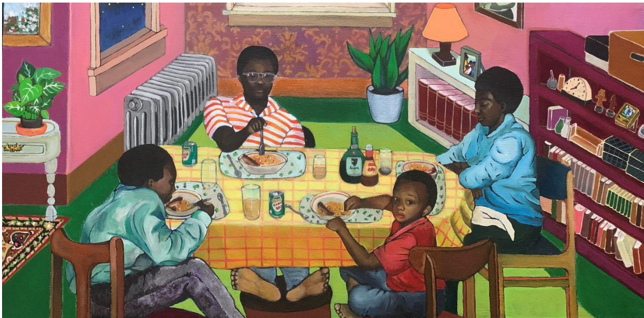
Is the Big Dipper out Tonight, 2020 by Mayumi Nakao

https://www.theartstudentsleague.org/exhibiton/merit-winners-2020/